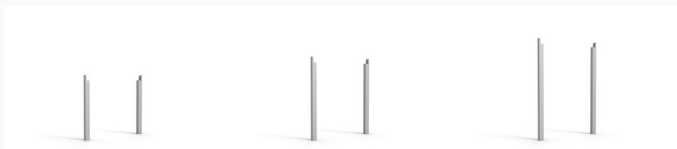
Set support legs EFFWP